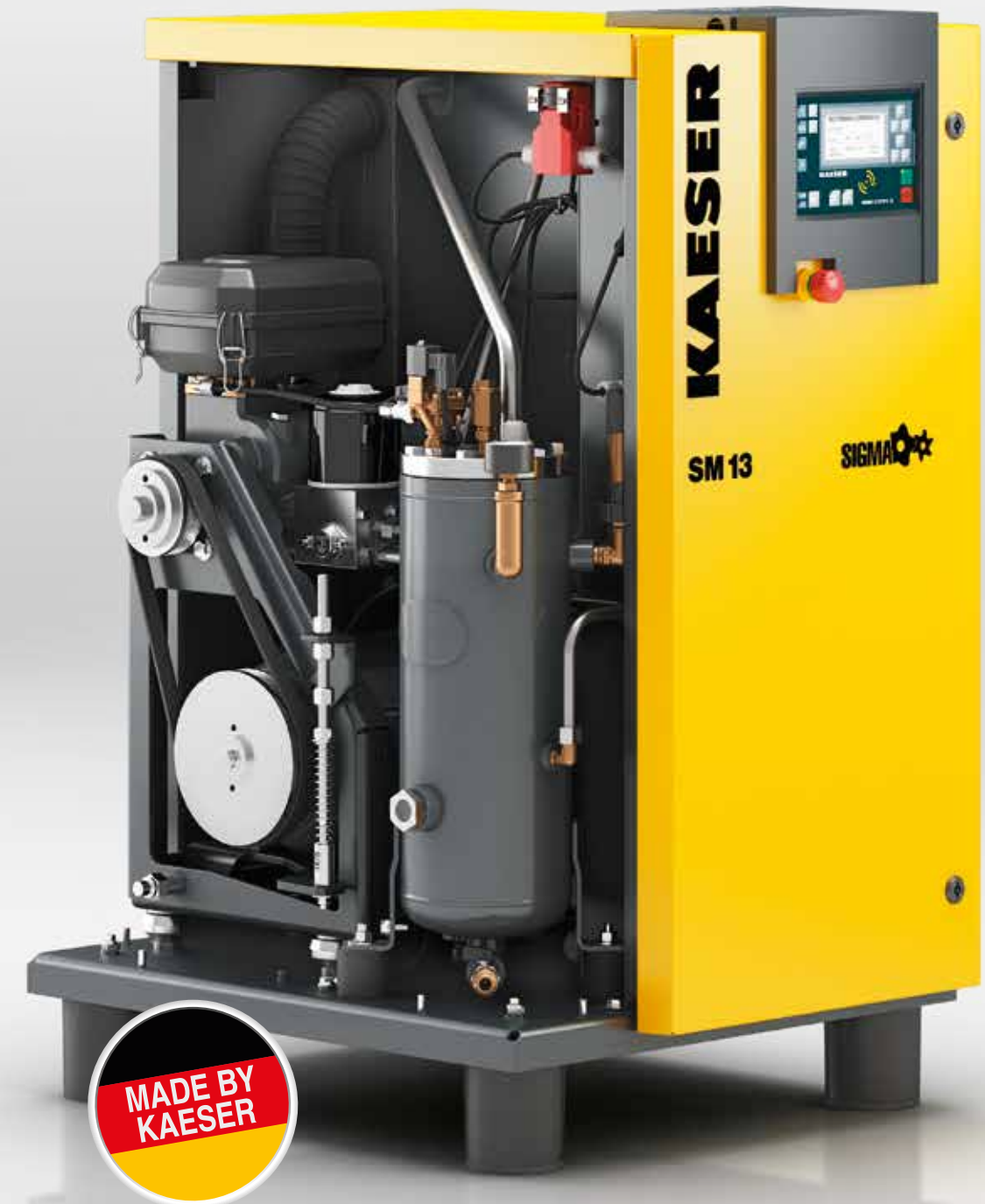
Image: SM 13