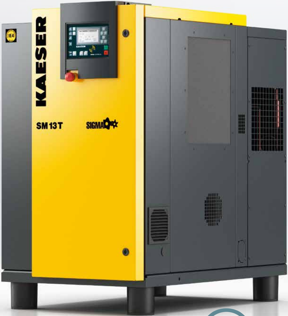
Image: SM 13 T

All maintenance work can be carried out from one side of the unit. The left housing cover is easily removed to allow excellent component accessibility.