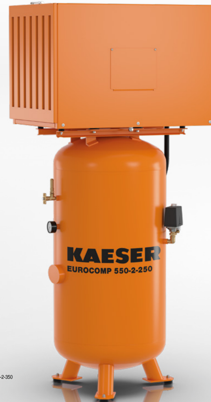
Image: EPC 550-2-350

High-quality components for a long service life