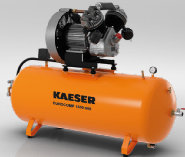
Image: EPC 1500-500