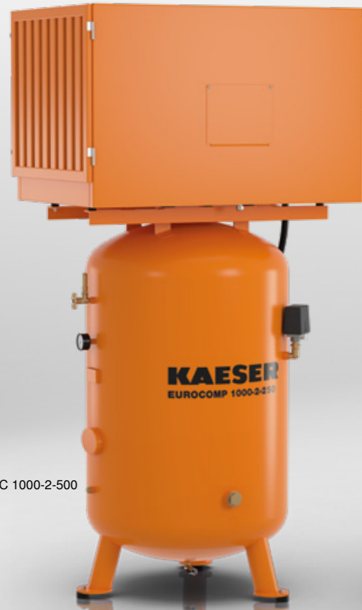
Image: EPC 1000-2-500