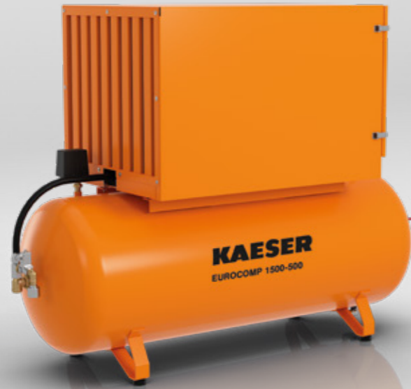
Image: EPC 1500-500