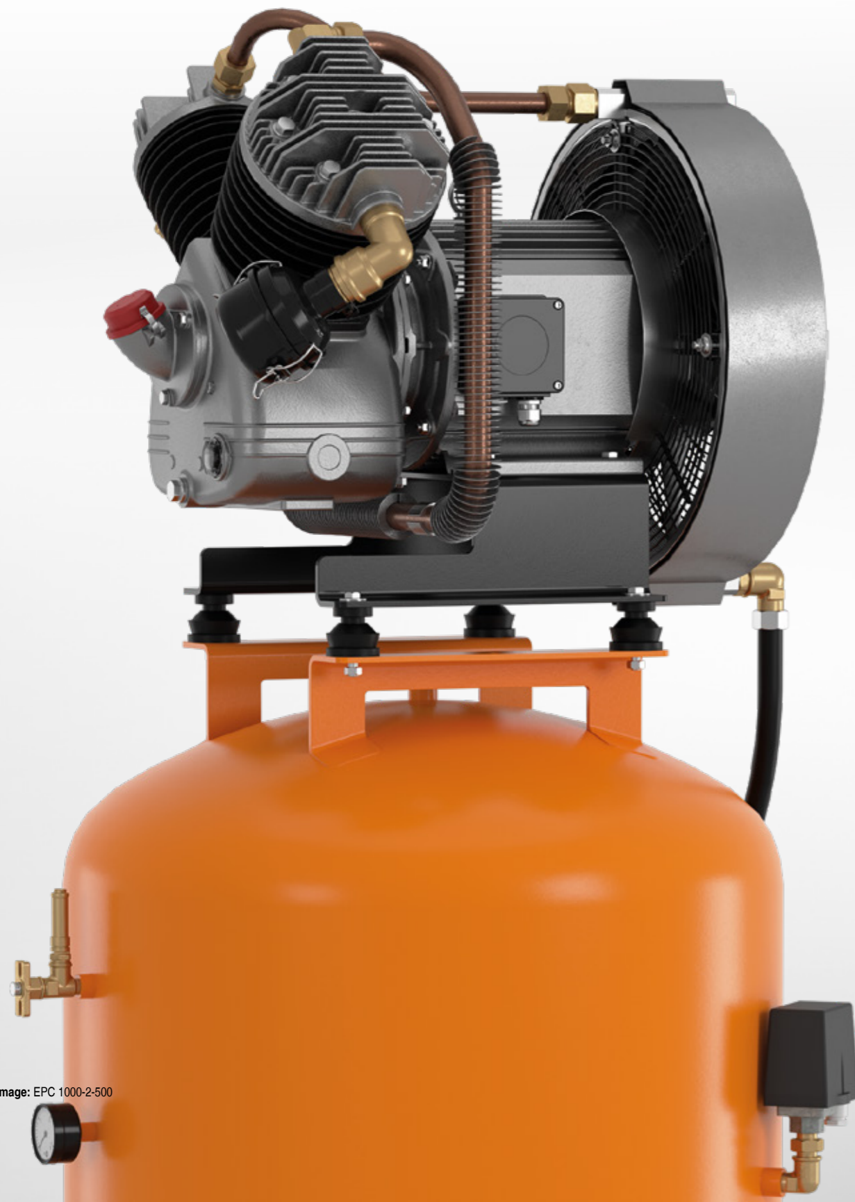
Image: EPC 1000-2-500